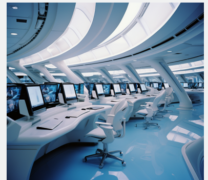
Specialized monitoring tools and best-practices

Each expert is assigned to a specific group of clients